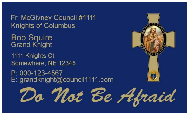
Example Front Side

These designs are available exclusively through the Nebraska State Council.